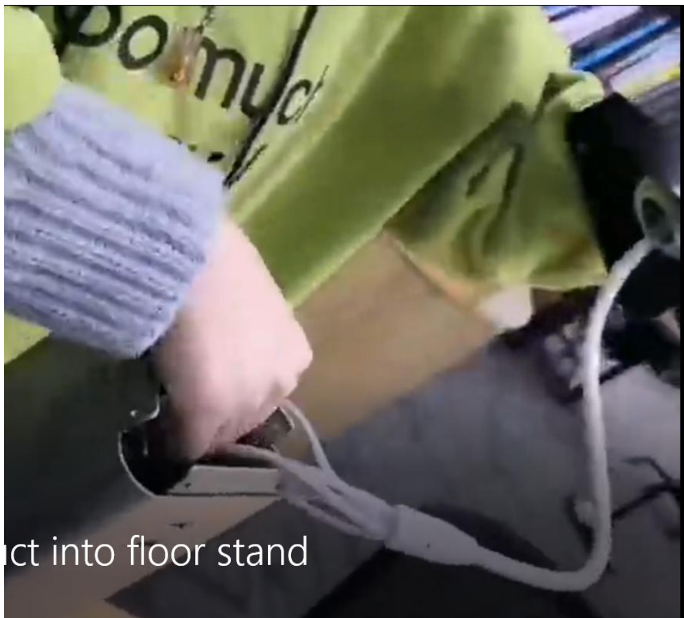
ct into floor stand